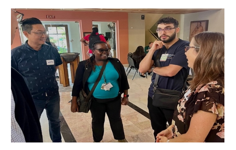
CPE Day @ St Camillus- July 17th, 2024

present as the MDs started to examine her and assess what was going on. Later, I met the daughter, who had been offered a seat outside the room, and started to offer support. The daughter seemed clearly distraught, sad, and tearful, and after introducing myself as the chaplain, I allowed her to take time to settle. It was then that the patient's heart stopped, and the ED team all took over trying to resuscitate her. As the MDs briefed the daughter about the situation and attempted to gather a history of her mother's illness, I remained by her side. The daughter then revealed that her mother had recently undergone cancer surgery and was discharged from a nearby hospital. She noted that her mom was doing much better when she came back home, but this week things seemed different, and she would be in and out of sleep, very weak and tired. The daughter noted that the mom was struggling to eat and could not keep anything down. Their plan for the day was to come and have her mom's incisions removed after her surgery, which, according to the daughter, took about nine hours because they needed to remove several organs.